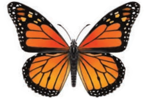
Monarch Danaus plexippus To 4 in. (10 cm)