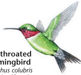
Ruby-throated Hummingbird Archilochus colubris To 3.5 in. (9 cm)